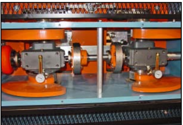
Dynamically Balanced Trim Press Drive

Irwin Research and Development Field Service Department, the fastest most responsive support