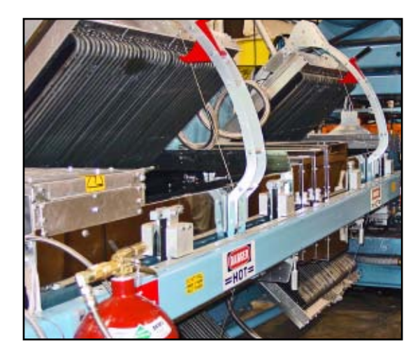
Adjustable Heat Tunnel

The 28NT Former is available in foam configuration utilizing a conventional platen set for mold mounting. This configuration is intended for shallow draw (2.5") foam or light gauge, solid sheet products. A second 28NT configuration for rigid products eliminates platens in favor of connecting the former rod